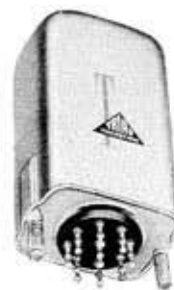
HS Series (GP Case)